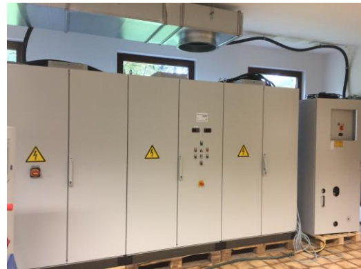
Fig. 7: 100 kW system with 1200 A, 100 V

Our DC power supplies, which were specially developed for the operation of the plasma burners, are characterised by extreme electrical stability and robust performance. The power supplies are adapted to the respective application and the corresponding power range. Power supplies in the range from a few kW up to 3 x 100 kW are available.