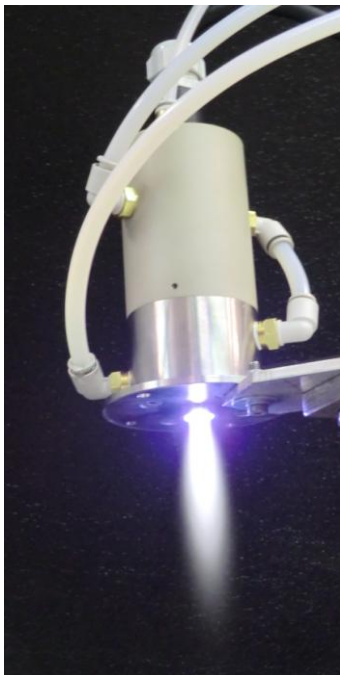
Fig. 3: Nitrogen plasma torch

The nitrogen plasma burner was developed as a decentralized air purification system especially for the semiconductor industry. Each system consists of a high-temperature plasma stage and a downstream wet scrubber. The core of the plant is a plasma torch powered by nitrogen as a plasma gas.