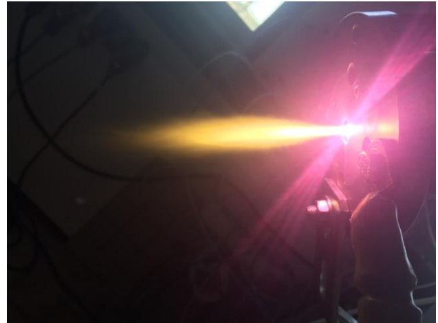
Fig. 2: Water vapour plasma source in use

Steam plasma burners are used mainly in CFC disposal and plasma pyrolysis.