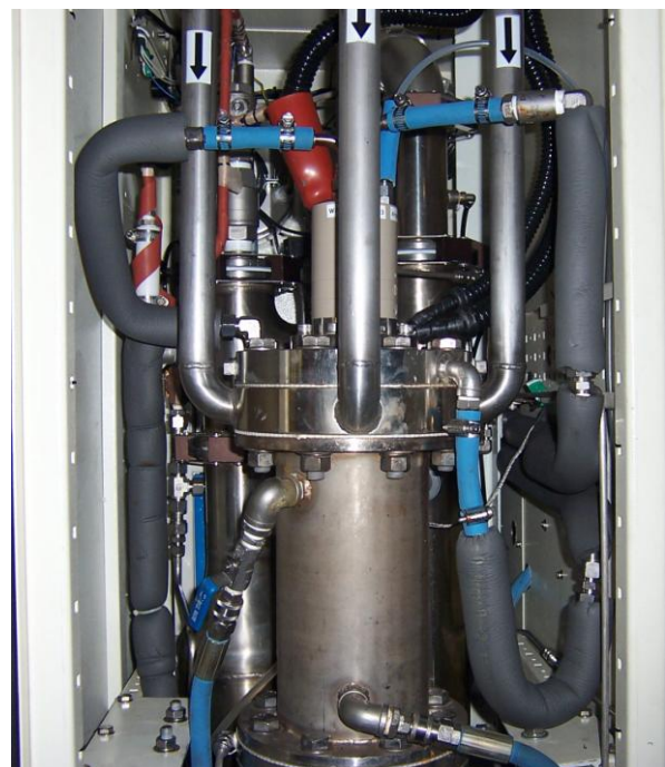
Fig. 4: decentralised exhaust air purification system