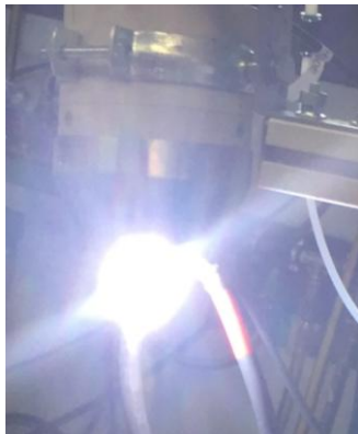
Fig. 6: 70 kW Argon source